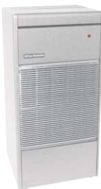
Console Electronic Air Cleaner / Ionizer Model 790AI-BLK (Black) Model 790AI-WHT (White)