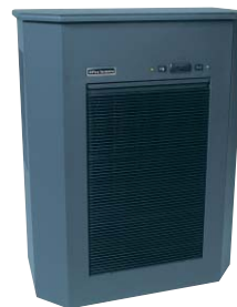
Deluxe Console HEPA Air Cleaner / Ionizer 900H-BLK (Black)

* Five Seasons INDOOR AIR QUALITY EXPERTS®