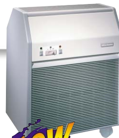
Deluxe Console Electronic Air Cleaner / Ionizer & VOC Filter Model 985AIV-WHT (White)